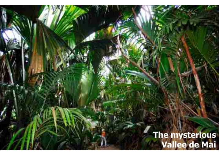
Day 2 - Sunday

the Captain's welcome briefing. Depart Port Victoria at disembarkation to the famous World Heritage Site, the Vallee community where ox-carts and bicycles still remain the most 1200hrs, sailing from Mahé to a late afternoon anchorage at de Mai Nature Reserve. This ancient forest is home to the common mode of transportation throughout the island. La Round Island, just off the isle of Praslin. In the evening, curiously shaped double coconut, the coco de mer, as well as Dique is home to the endemic Seychelles Paradise Flycatcher, introduce yourself to Creole cuisine with a welcome barbecue the Black Parrot, unique to Praslin. Explore the valley's eerie and is perhaps most famous for its massive granite boulder or enjoy other water sports.