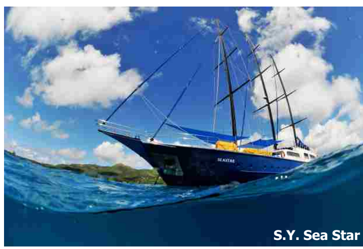
Day 5 - Wednesday

Soeur (the Sisters) for excellent snorkelling and diving, and for After lunch, sail to Aride Island, a globally important nature uninhabited island. Experience the island's vast mangrove a relaxing visit of these unique and completely uninhabited reserve with more native bird species than any other island, forests and its giant tortoise farm, along with the historic ruins tropical islands. In the afternoon, visit Coco Island, one of including five endemics and the world's largest population of 3 of this former leper colony. After a barbecue lunch on the Seychelles' tiny granite jewels, a fantastic spot for snorkelling species (Lesser Noddy, Audubon's Shearwater and Seychelles island, enjoy an array of water sports or simply relax and enjoy the only natural location in the world for Wright's Gardenia and water-sports. 400 species of fish have been recorded around the island.