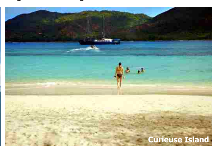
Day 6 - Thursday

Warbler). The nature trail leads to a spectacular cliff-top view the island's beautiful beach and turquoise waters. Sail to St. with the largest frigatebird roost outside of Aldabra. Aride is Pierre, the small granite outcrop just off Praslin for more