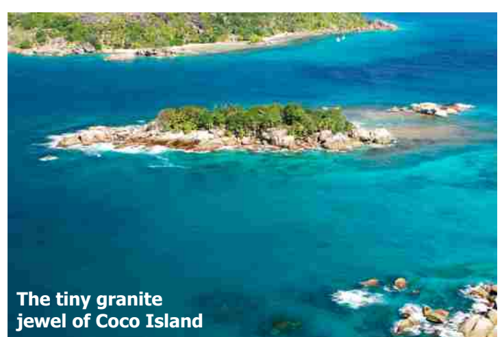
In the morning the vessel sails toward Grande Soeur and Petite Sail to Booby Island for a morning of diving and water sports. In the morning disembark at Curieuse for a visit of this virtually within a kaleidoscope of tropical fish.