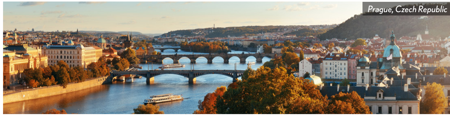
Prague, Czech Republic

Prague, the capital and largest city of the Czech Republic, is one of the most photogenic cities in Europe. This was the only large Eastern European city to survive WWII without being destroyed by bombs. With gothic towers, ancient cathedrals, and the largest castle in the world, Prague is one of Europe's great cities to visit.