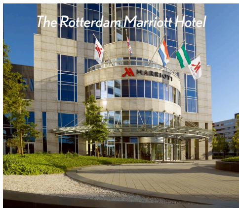
The Rotterdam Marriott Hotel