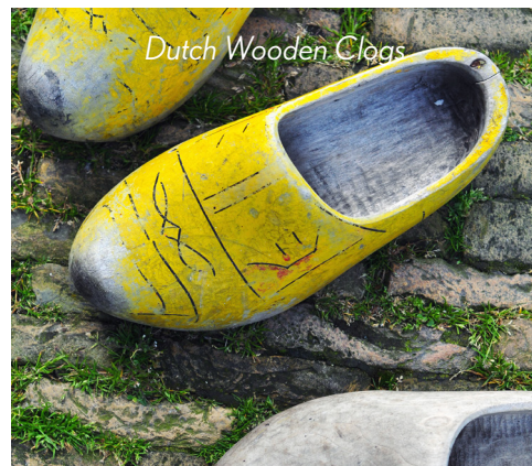
Dutch Wooden Clogs

Kinderdijk is a small village a little over nine miles east of Rotterdam with the largest concentration of old windmills in the world! The 18th century windmills of Kinderdijk are one of the major tourist sites in the country and are on the UNESCO list of World Heritage Sites. You will be mesmerized by the beauty of this landscape.