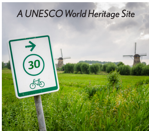
A UNESCO World Heritage Site