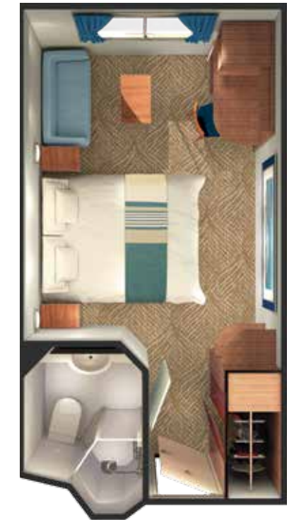
OC OCEANVIEW PICTURE WINDOW Sleeps up to three.