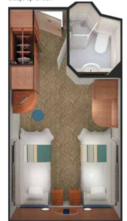
IB INSIDE Sleeps up to four.