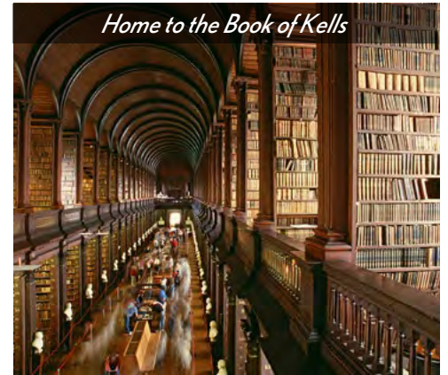
Home to the Book of Kells