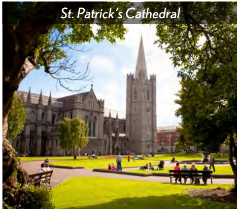
St. Patrick's Cathedral