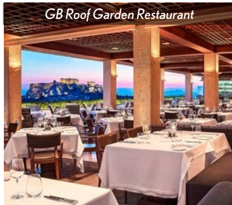
GB Roof Garden Restaurant