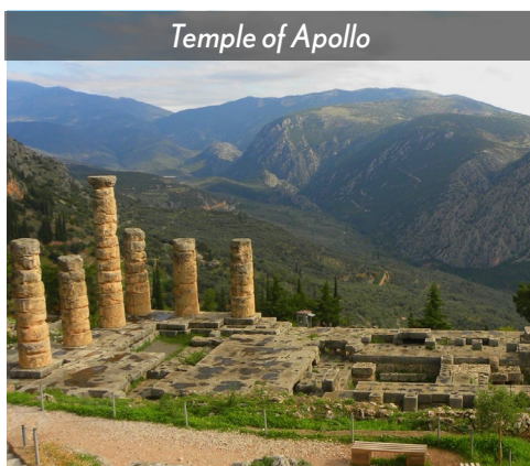
Temple of Apollo