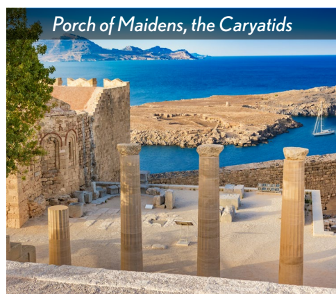
Porch of Maidens, the Caryatids