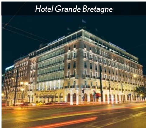
Hotel Grande Bretagne